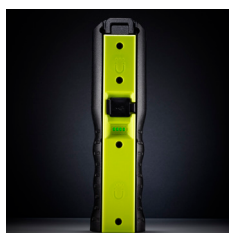
BATTERY LEVEL & CHARGING INDICATOR LEDS