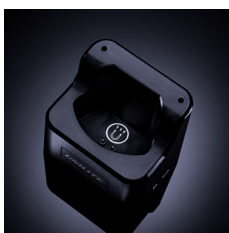
MAGNETIC CHARGING DOCK

BATTERY 3.7v 5000mAh Li-ion Rechargeable Battery WEIGHT 406g DIMENSION 216 x 58 x 38mm